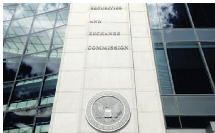
The U.S. Securities and Exchange Commission building in Washington is pictured on Aug. 5, 2017.